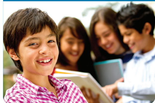
For tips on talking with patients and parents and other resources see http://www.immunizebc.ca/infographic/story.html

The 'HPV vaccine is cancer prevention' message resonates strongly with parents. Studies show that a strong recommendation from you is the single best predictor of vaccination. 12,13