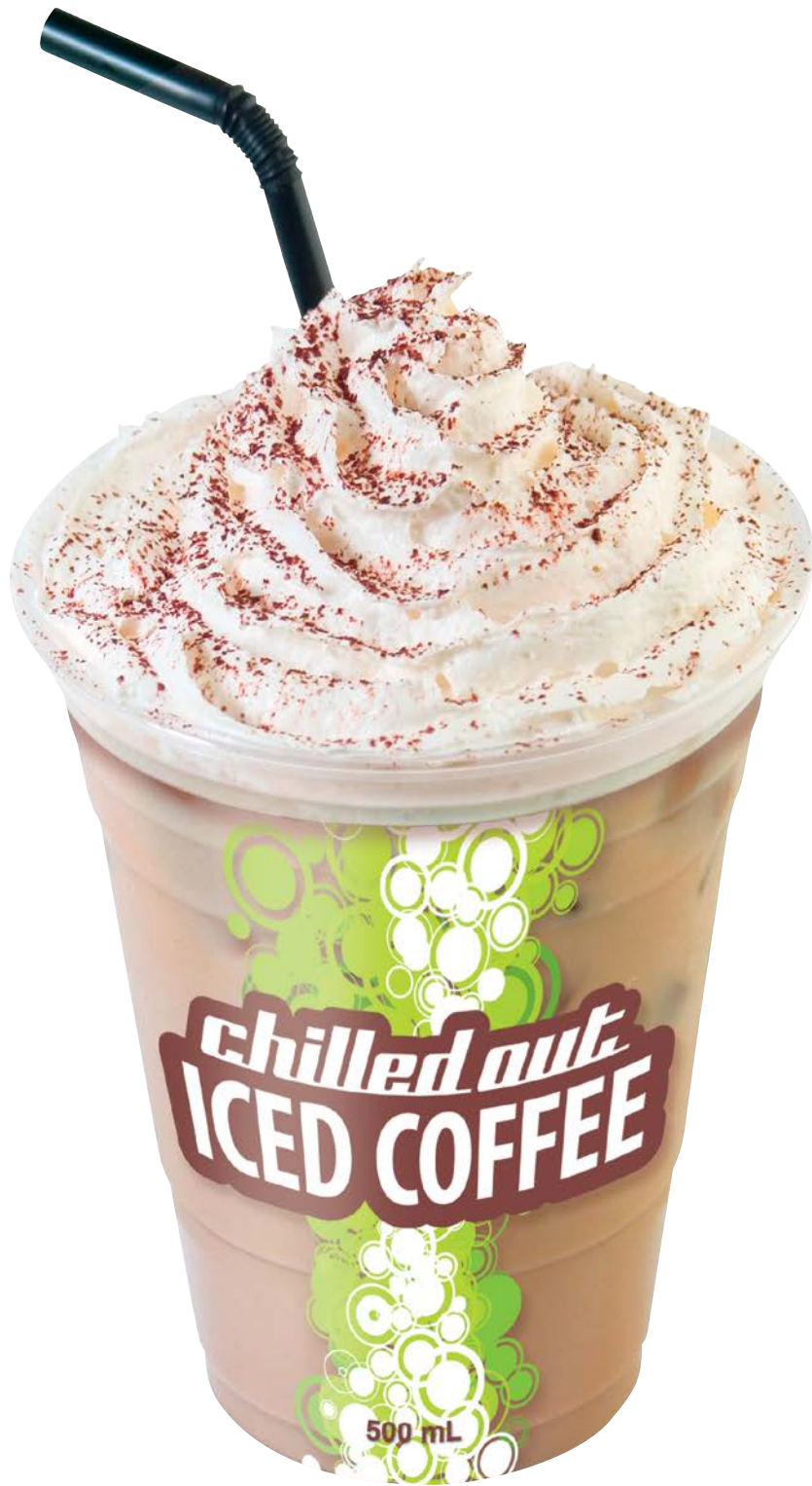
Sip Smart! BC™ Iced Coffee - Front