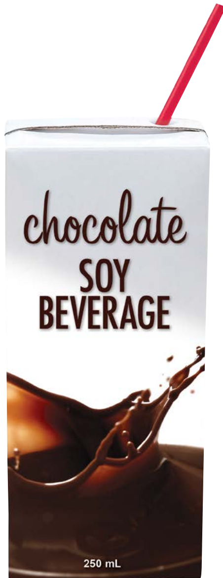
Sip Smart! BC™ Chocolate Soy Beverage - Front